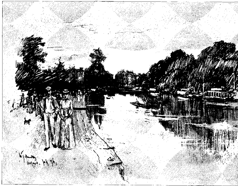
"THE TOW-PATH ALONG BY THE RIVER."

"Ah! you evidently don't know the man, or you wouldn't ask. There's something damnable about him, something reptilian. My gorge always rises at him. I should put him down as a man with secret vices—an evil liver. He's no fool, though. They say that he is one of the